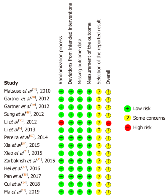
Figure 3 Risk of bias in individual studies.

and intravenous BMMSC administration in sciatic nerve injury models suggest that systemic treatment provides a more significant improvement in nerve conduction, whereas local treatment improved neuronal fibre counts [62] . Other experiments have shown that peripherally injected MSCs localise to nerve lesions in murine models of sciatic nerve injury [63] . It could be inferred from these findings that there are differing mechanisms and sites of action for the two methods of implantation, suggesting that a treatment regime including both delivery methods concomitantly may produce the best outcome.